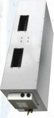
DUCT TYPE FDJ10 – FDJ14