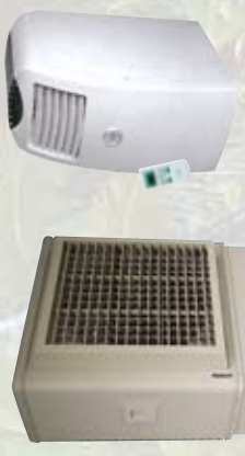
PORTABLE UNIT FUJ39