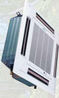
CASSETTE TYPE FCJ10 – FCJ12.8