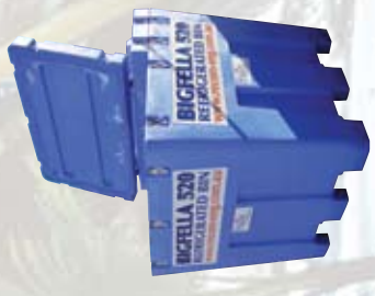
BIGFELLA 520 REFRIGERATED BIN